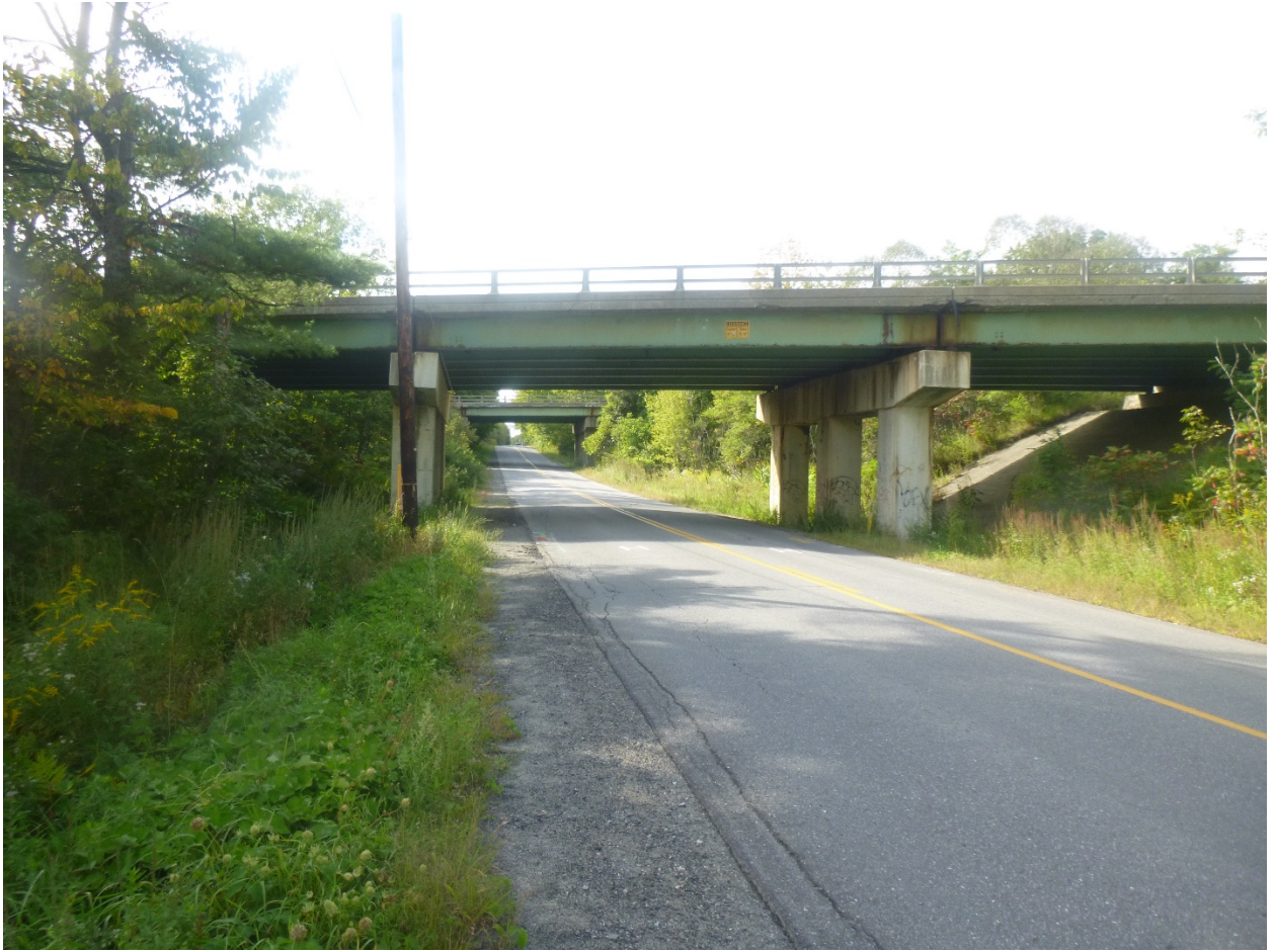
I-95 / Webb Road Bridges in Waterville